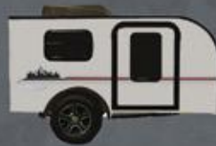
Silver Moon (Metallic)

*Colors shown are simply a representation of what is available. Actual color can vary