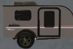
Charcoal Storm (Metallic)